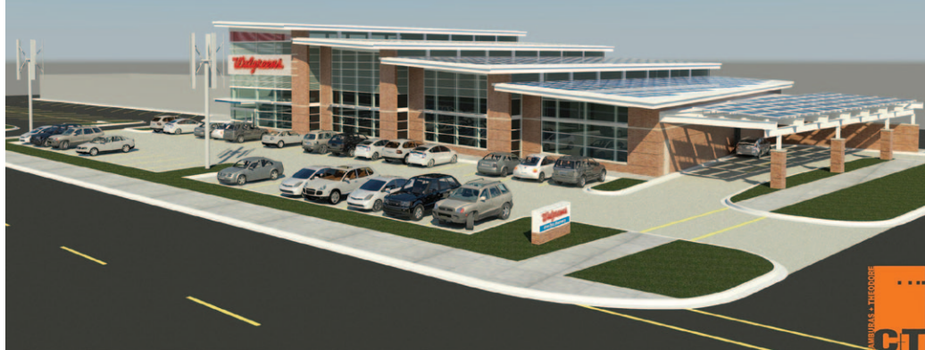
An architectural rendering of Walgreens proposed net zero energy retail store.